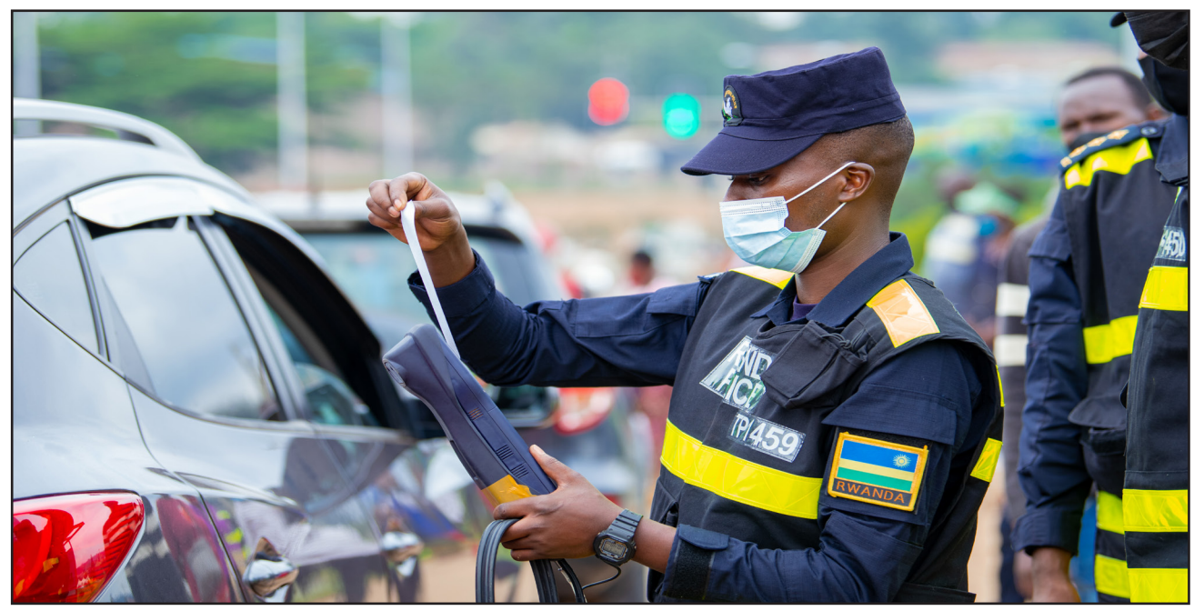
A police officer is testing fuel emissions from a vehicle on the street in Kigali

Rwanda Environement Management Authority (REMA), Rwanda National Police and the Rwanda Standards Board have on September 5, 20221 launched a campaign to further raise awareness on air pollution and fuel emission control measures.