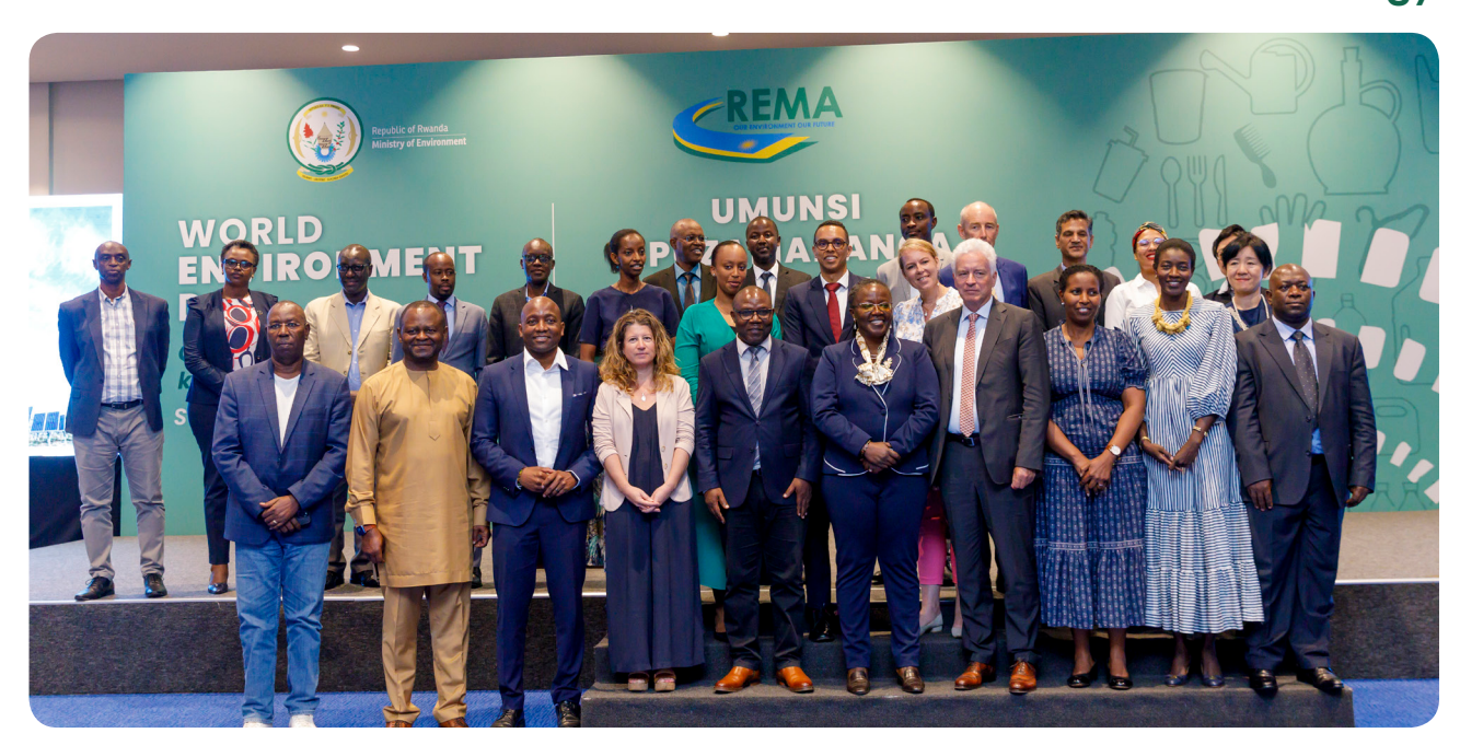
Government Officials in a group photo with development partners after the launch of the revised Green Growth and Climate Resilience Strategy

wanda has on June 5, 2023 launched the Revised Green Growth and Climate Resilience Strategy as part of World Environment Day celebrations. The strategy has been revised by the Ministry of Environment in partnership with the United Nations Development Programme, and aims to define a development pathway for Rwanda that is climate resilient and harnesses green economic innovation.