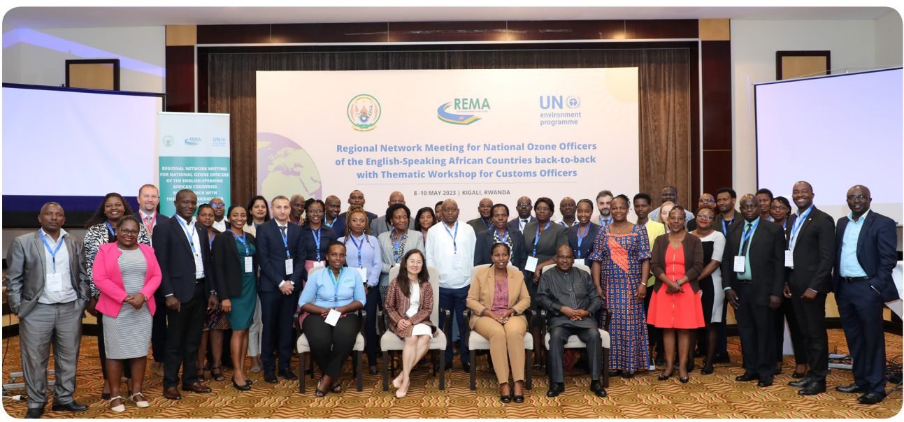
National Ozone Officers from African English Speaking countries met in Kigali to discuss the implementation of the Montreal Protocol and Kigali Amendment

he Rwanda Environment Management Authority (REMA) in collaboration with the United Nations Environment Programme (UNEP)'s OzonAction has from 8-12 May 2023 organized a five-day regional network meeting for National Ozone Officers of the English-Speaking African countries back-to-back with Thematic Workshop for customs Officers.