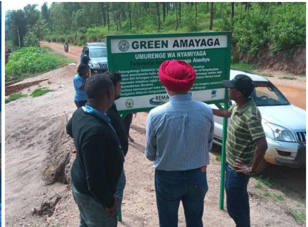
Field Mission in midi-term evaluation