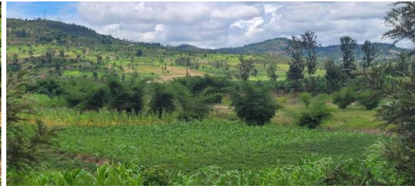
Status of landscape interventions