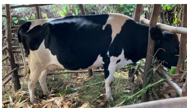
Status of distributed livestock (Pigs and Cows)