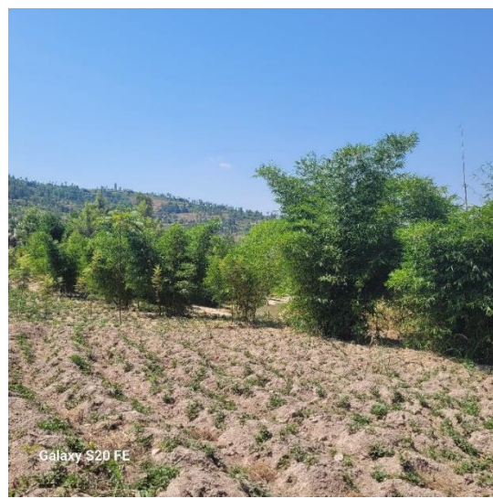
Status of river buffer zone