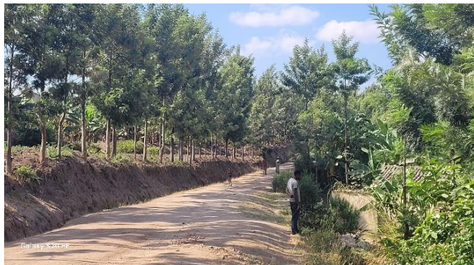
Status of Afforestation roadsides