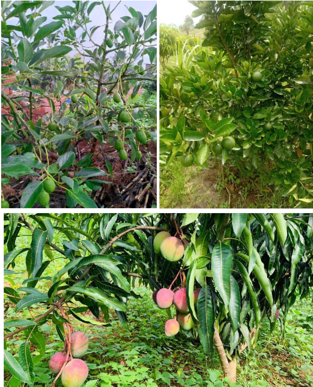
Status of planted fruits (Avocadoes, Mangoes and Oranges)