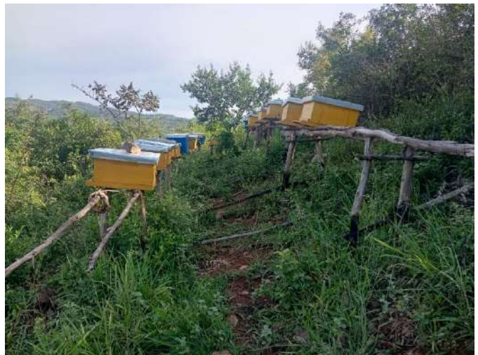
Beekeeping project for CDD Group around Kibirizi-Muyira Natural Forest