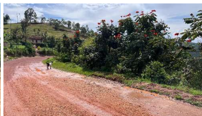
Status of Afforestation roadsides in Gisagara and Kamonyi Districts