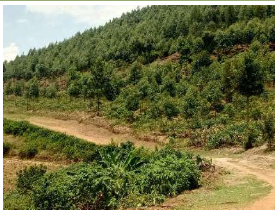
Status of Afforestation woodlots in Nyanza and Kamonyi Districts