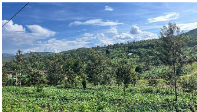
Status of complete agroforestry in Ruhango and Kamonyi Districts