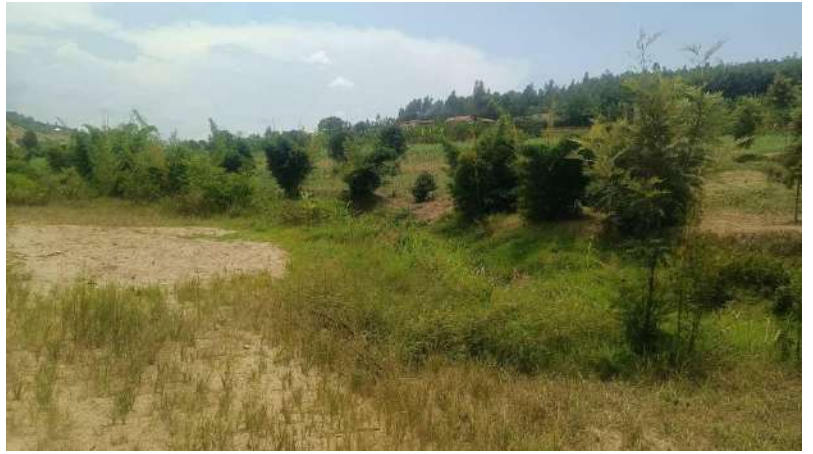
Status of river buffer zone Nyanza and Kamonyi Districts