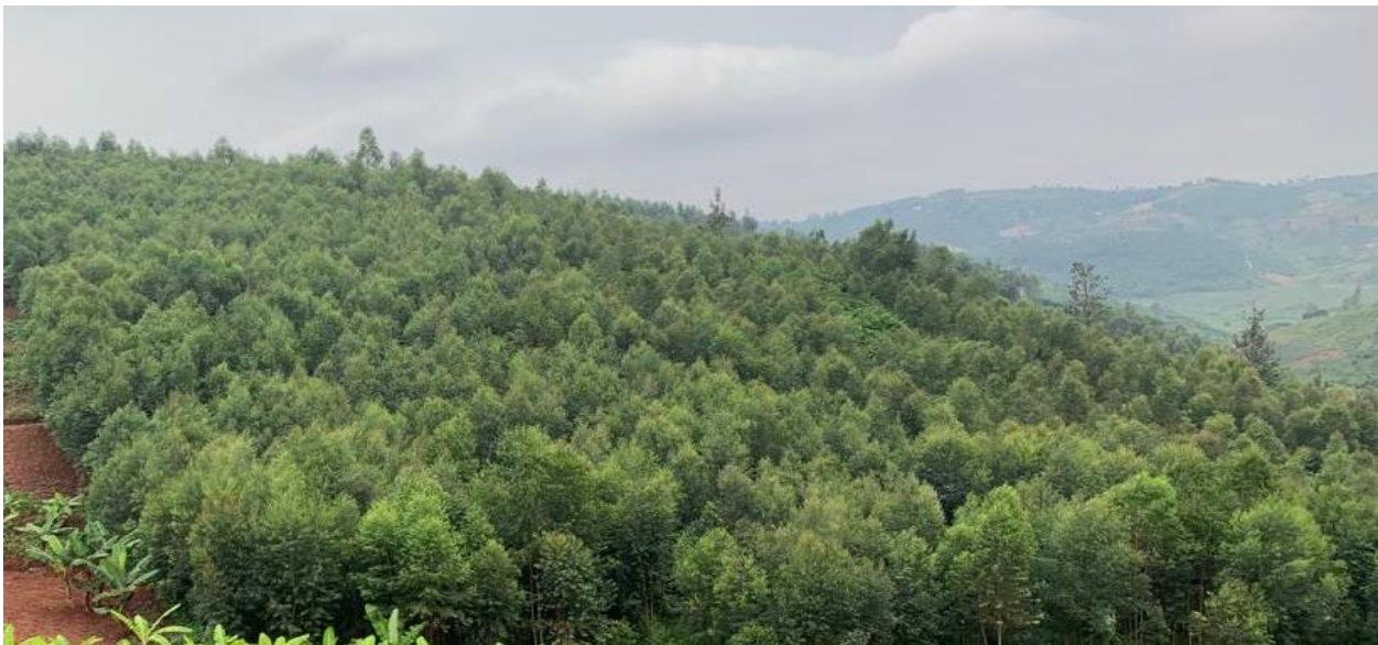
Status of afforestation woodlot