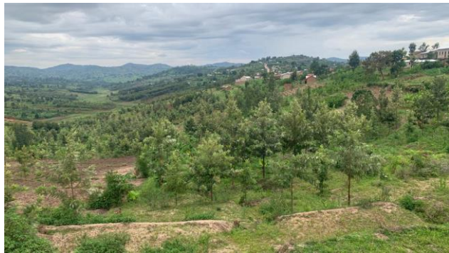
Status of complete agroforestry