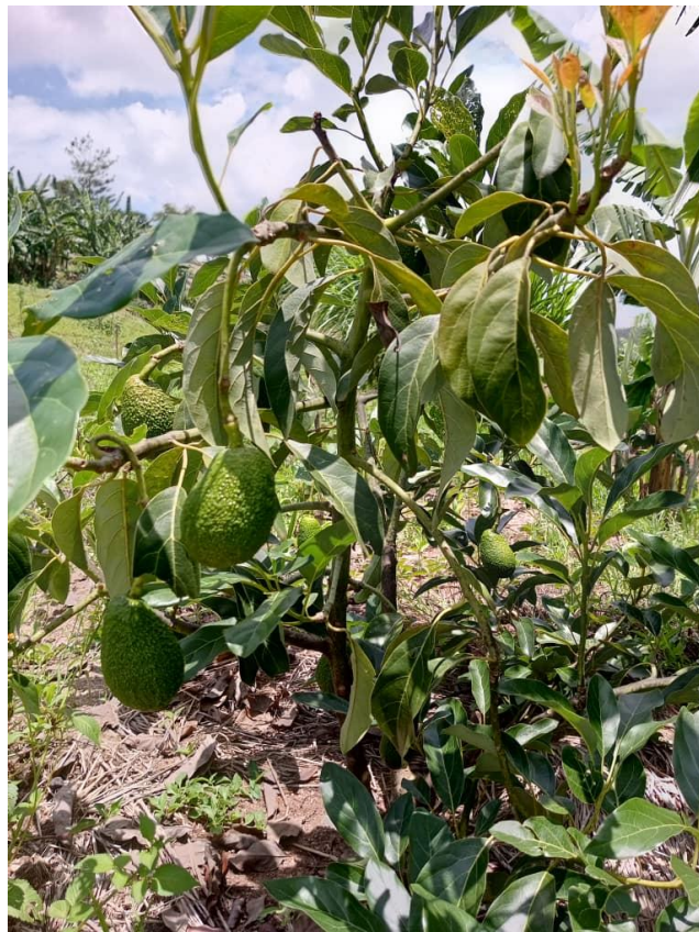
Status of planted fruits