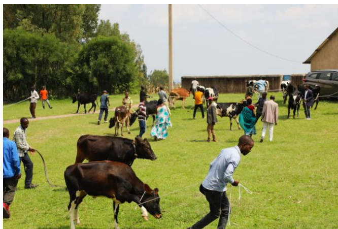
Distribution of livestock (Cows) in Ruhango District