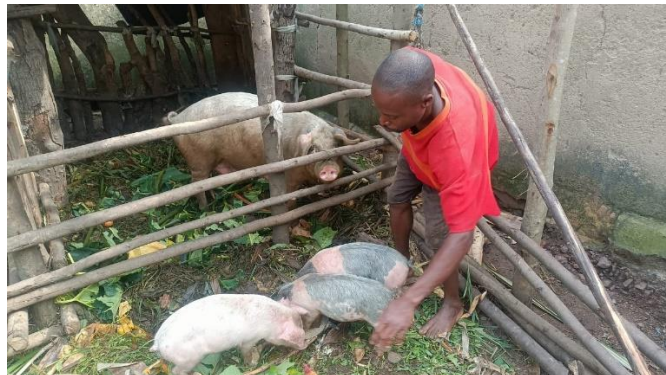
Status of livestock (Cows and Pigs) already distributed to project beneficiaries