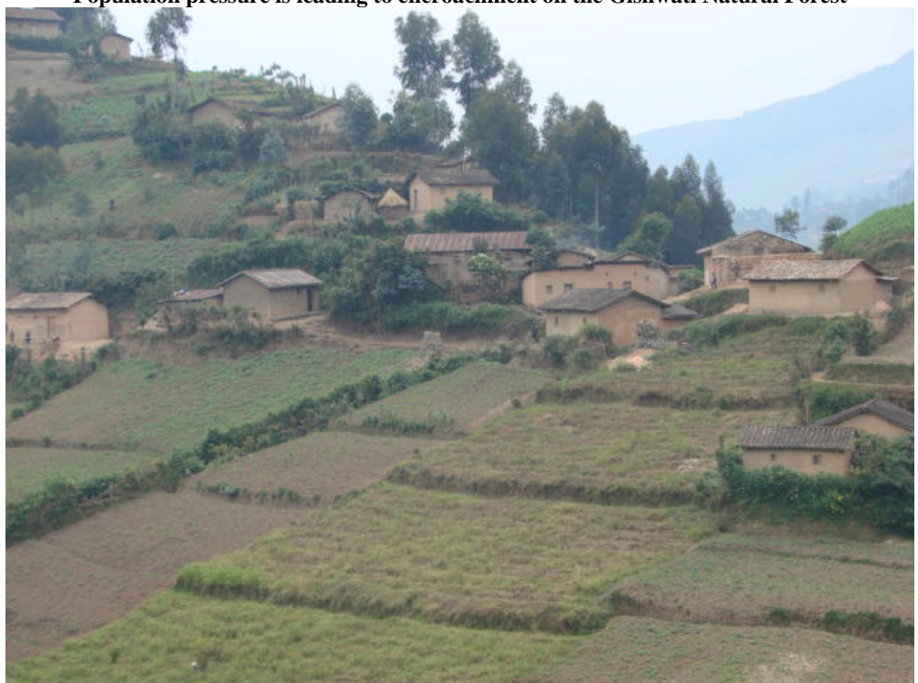
Population pressure is leading to encroachment on the Gishwati Natural Forest

The vulnerability of Rwanda's agriculture to climate change and the interest of government in ensuring food security compel government to pursue adaptive measures in mitigating the impacts of climate variability and climate change. In the same vein, government enhances the capacity of its delegations to the international negotiations on a new global regime for managing climate change. It also seeks to access available trust and non-trust funds for mitigation and adaptation to climate change.