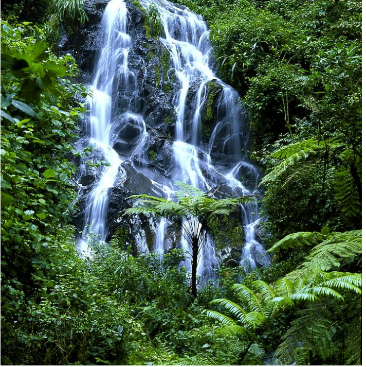
A waterfall in Nyungwe national park

However, there are a number of opportunities that Rwanda could seize in promoting conservation and sustainable use of its biodiversity and genetic resources. These include the promotion of nature-based tourism, using the genetic resources in developing pharmaceutical and cosmetic industries, and using relevant components of the biodiversity to participate in global trade in carbon. Of concern are the lack of a biodiversity policy and law; weak enforcement of existing policies and laws and the lack of protection of biodiversity outside the protected areas as well as the endangered species and important bird species.